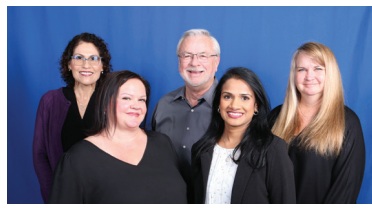
Administration & Audit