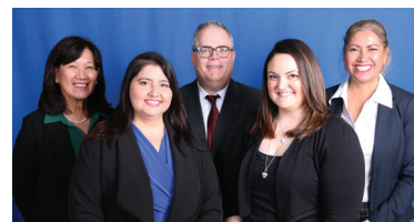
Real Estate Lending & Loan Servicing