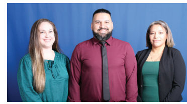
Business Account Representatives