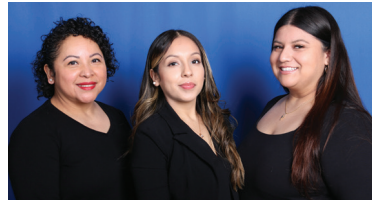
San Fernando Branch