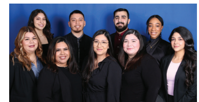
Sales & Service