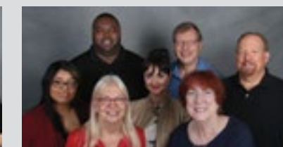
Committee of CU Volunteers